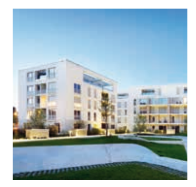
Centrally located Central Living, Frankfurt Apartments: 100