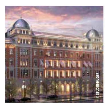
Splendour in Vienna Kempinski Palais Hansen, Vienna Rooms: 151