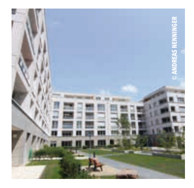
The other centre Hohenzollerndamm, Berlin Apartments: 136