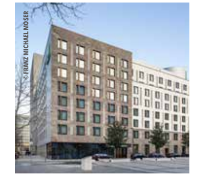
City hotel Holiday Inn Alte Oper, Frankfurt Rooms: 249