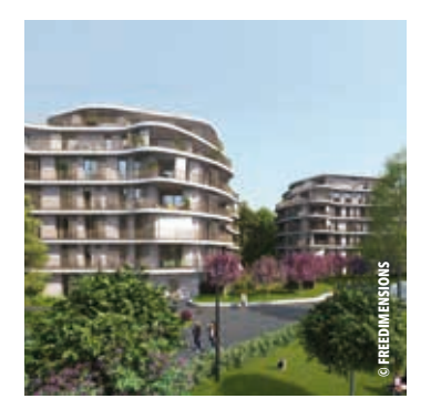
Like in the movies Rosenhügel, Vienna Apartments: 205