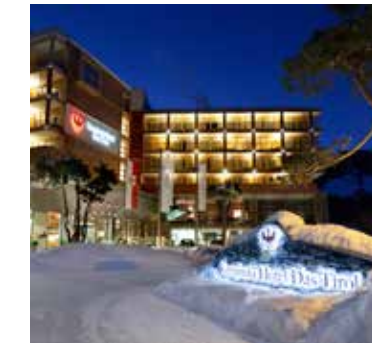
Five stars in the Alps Kempinski Das Tirol, Jochberg Rooms: 144