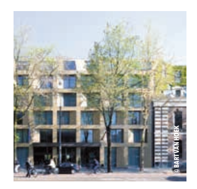
Luxury in Amsterdam Hyatt Regency, Amsterdam Rooms: 211