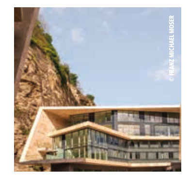
Architectural icon Sternbrauerei, Salzburg Apartments: 100